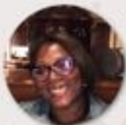
Mocha Girl Joy Philadelphia Chapter

Welcome the New Chapters in our bookish Sisterhood